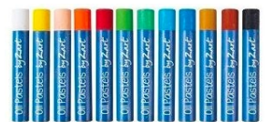
Oil Pastels Basic Large Pk12 OILPASTEL