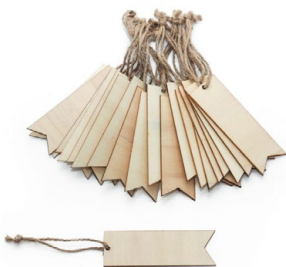
Wood Tags Pack of 20 WSH9857