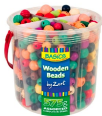
Beads Wooden Tub 575g BEADWTUB575