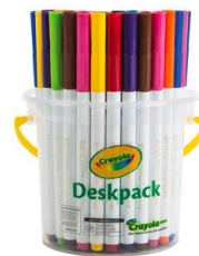
Crayola 40 Super Tips Deskpack C588240