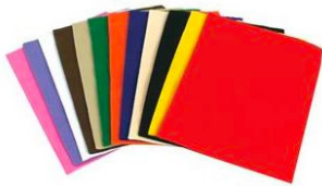
Felt Squares Asstd 22.5x30cm Pk24 FELT24