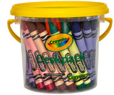
Crayola 48 Large Crayon Deskpack C522048