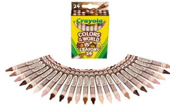
Crayola Colours Of The World Crayons Pack of 24 C520108