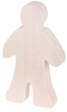
Wooden Person Small Pack of 10 CSWP302