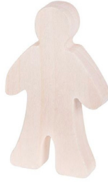
Wooden Person Large Pack of 10 CSWP303