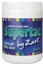
Supertac Glue 550ml SUPTAC