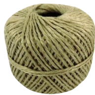
Twine Jute Fine Original String 75m TWJ70