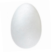
Poly Eggs 70mm Pack of 10 POLEGG10