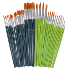
Paint Brush Taklon Assorted Pk32 BRTAK32