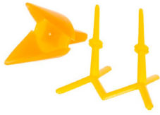
Plastic Bird Beaks & Feet Pack of 60 BIRDFBEA