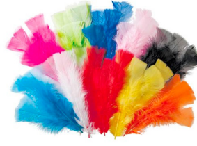
Feathers Large 60gm Pack 240 FETHLG60