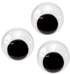
Eyes Glue on Black & White 7mm Pk100 EYES7