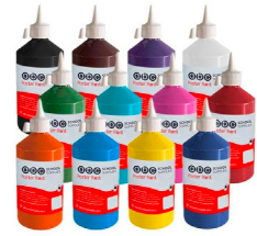
ABC Poster Paint 500ml Set of 12 DCPP500MLST