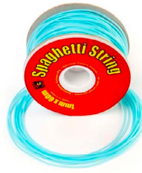
Spaghetti String 1mmx60m Pale Blue SKSGHETTIPB