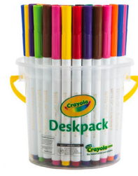
Crayola 40 Super Tips Deskpack C588240