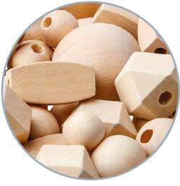
Beads Wooden Natural Assorted Pk92 BEADNAT