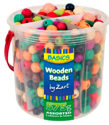
Beads Wooden Tub 575g BEADWTUB575