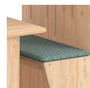
Green/Blue Seatpad Topper